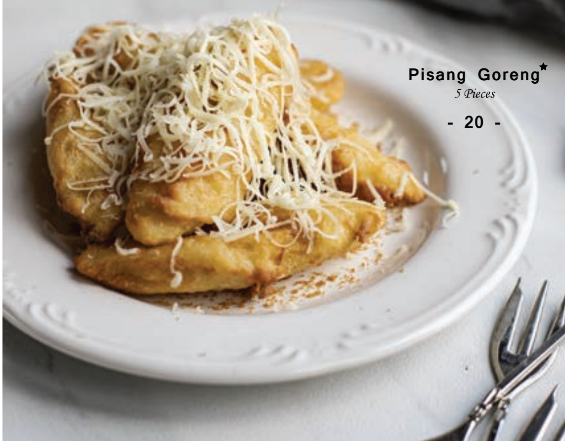
Pisang Goreng ★