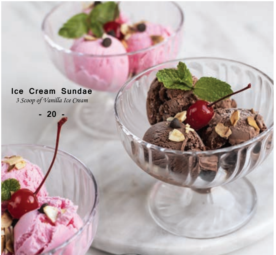
Ice Cream Sundae