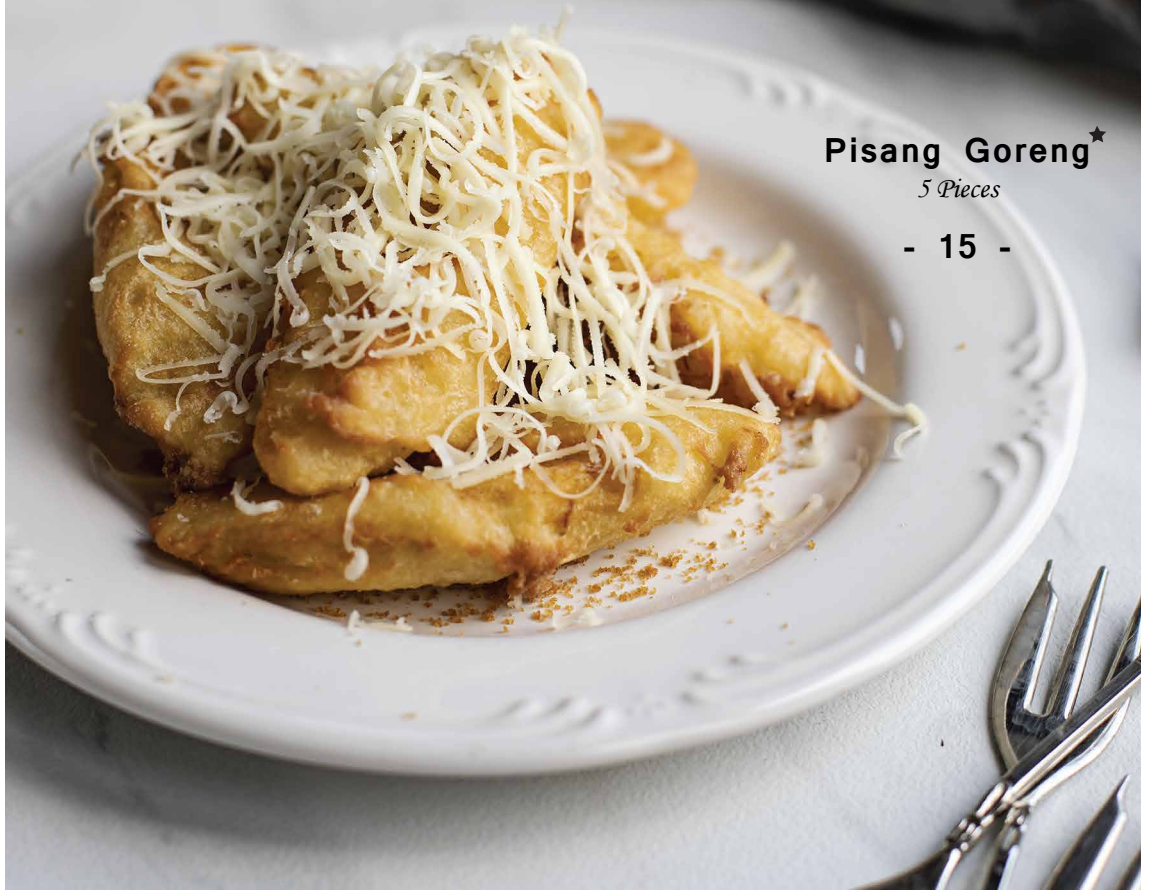
Pisang Goreng ★