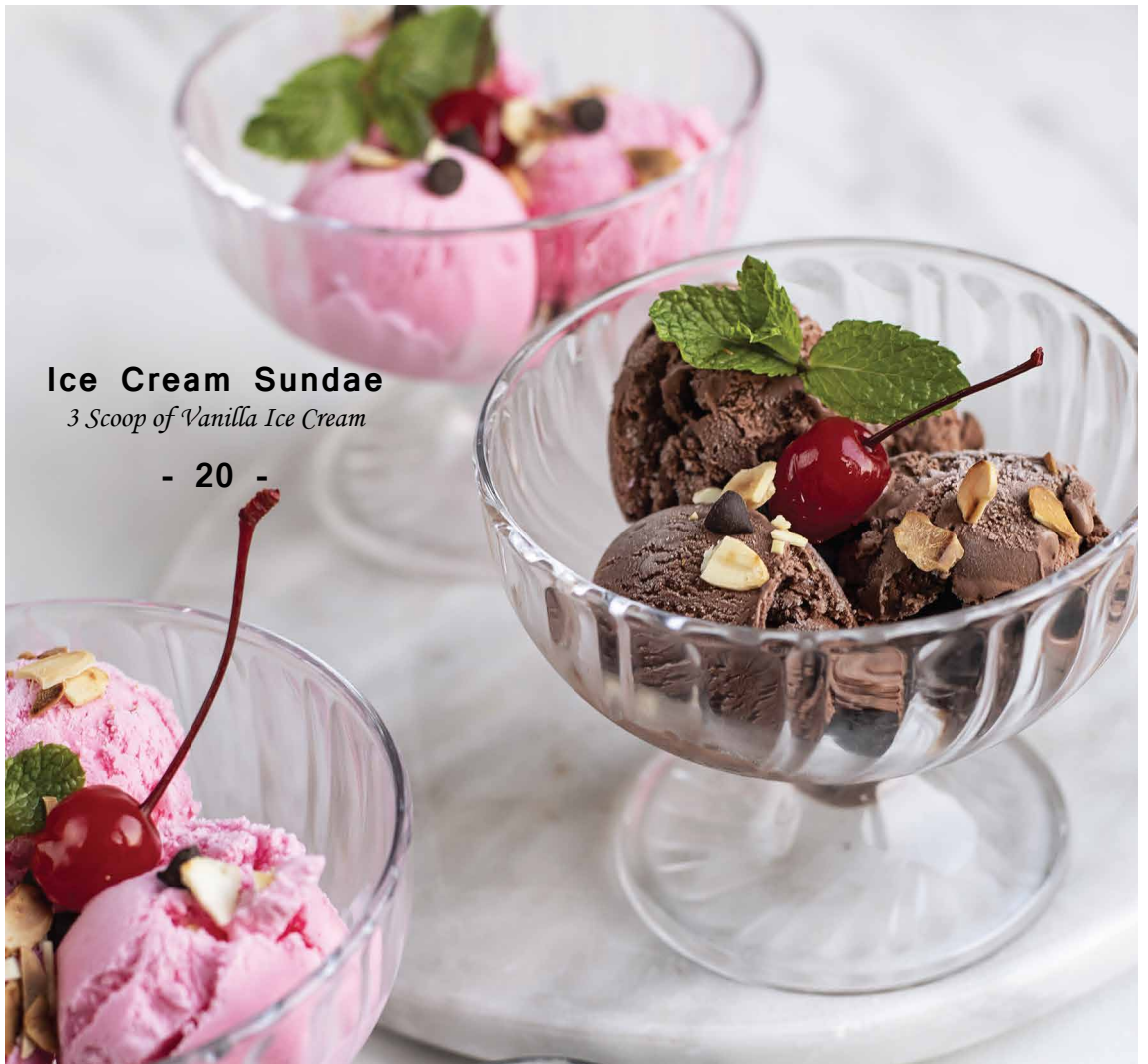
Ice Cream Sundae